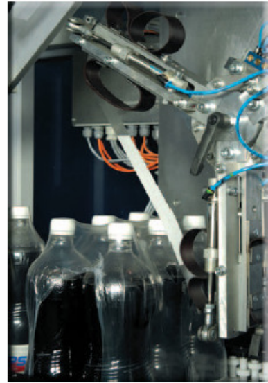
applicator turret head ▶