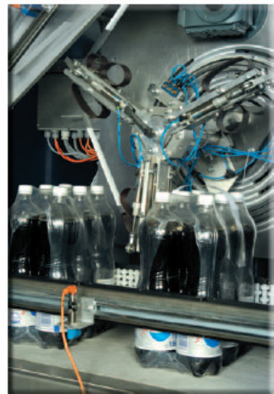
handle bonding ▶